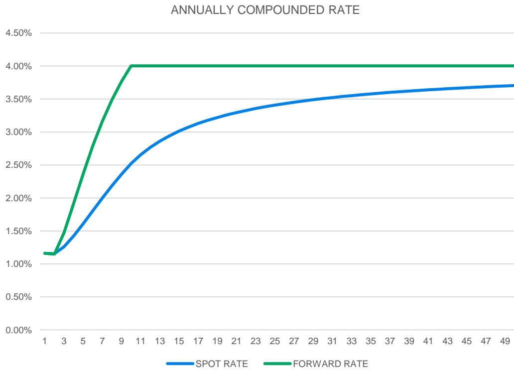
FIGURE 7: SPOT AND FORWARD RATE CURVES FOR ASSET CALIBRATION SET USING AN MLES INTERPOLATION AND CONSTANT FORWARD RATE EXTRAPOLATION METHOD

Figures 7 and 8 show the resulting spot and forward yield curves of one to 50 years for the calibration set using the MLES method and extrapolated with the constant forward rate extrapolation method. Spot rates shown are quoted as annually compounded rates on zero coupon bonds with maturities of the specified term, forward rates shown are 1-year forward rates ending at the specified term.