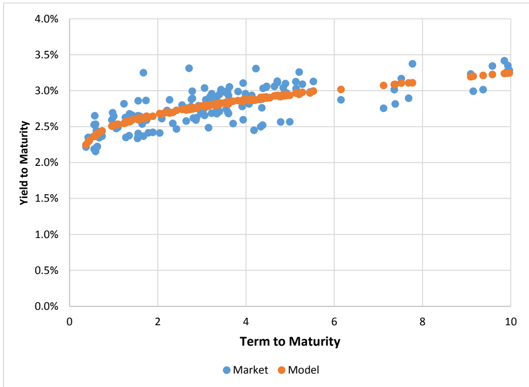
Figure 6: Modelled vs. Market Yields to Maturity for Asset Calibration Set Using the MLES Method with Inverse Duration Weightings

Figure 6 shows the modelled yield-to-maturity for each bond in the asset calibration set, compared with the actual yield-to-maturity, using the MLES method with inverse duration weightings. Note that these are the same bonds as those discussed and analysed in Section 2 above.